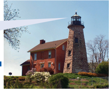
Charlotte-Genesee Lighthouse America's oldest surviving lighthouse on Lake Ontario

News from the Charlotte-Genesee Lighthouse Historical Society