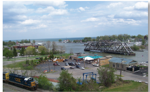
Port of Rochester. Phase 1 of the Marina Project would be adjacent to the ferry terminal at rear; phase 2 adjacent to the swing bridge.

New commercial and residential development of the port could mean new prominence for the Charlotte-Genesee Lighthouse Museum as an attraction in the Charlotte neighborhood. It could also literally put walls between the lighthouse and the rest of the harbor that gives the museum its context. Likewise, a connection to the county trail system could drive a lot of new foot and bike