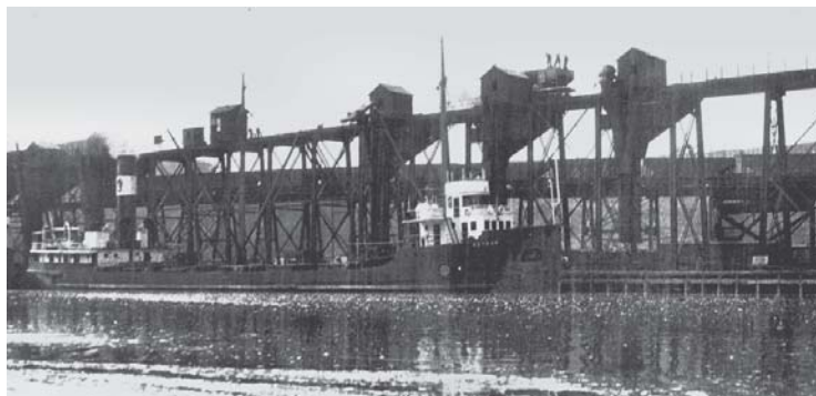
Barge "KEYBAR" at the Coal Trestle taken circa 1928 Note the 3 men on coal car on trestle. The man in the center is breaking up the coal with a bar so that it will slide down the chute.

Both the Roberts and Yates docks were served by sidings off the Charlotte branch of the New York Central (NYC). In the 1880's the Roberts coal dock burned and was not rebuilt.