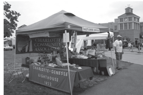
Fire Event