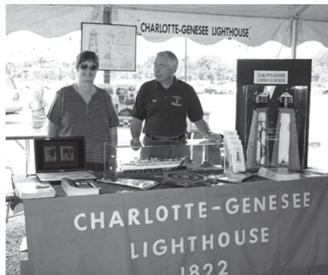
Table At Earth Voyager Event

I will continue our participation at events around the community such as the recent Earth Voyager day and the Smoke, Flames & Courage II at the Rochester Terminal. We hope to have a table at the Harvest Craft Faire at Monroe Community Hospital on Friday, Nov. 21st and Sat., Nov. 22, from 9:00 AM until 4:00 PM. Please stop by and see our display.