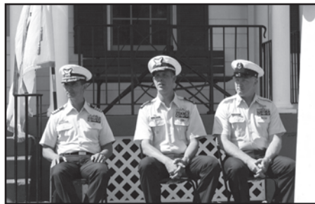
July 25 - USCG Change of Command